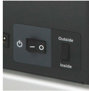
Rewinding direction switch to rewind "inside or outside" label rolls