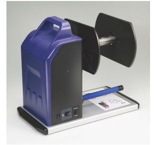
Stylish appearance plus a rugged design for long term reliability