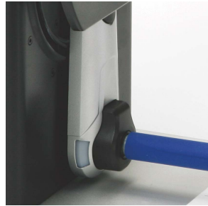
Colored LED indicator provides rewriter operation status